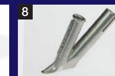
Speed welding nozzle 5 mm