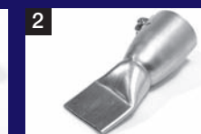
Wide slot nozzle 40 mm