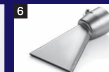
Wide slot nozzle 70 mm