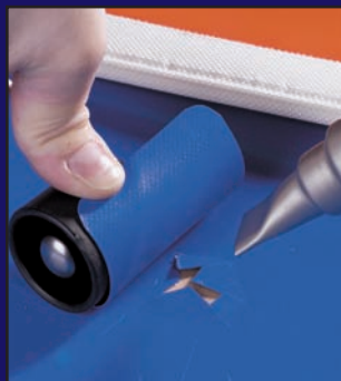
Welding a patch on a tarp