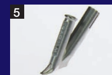
Speed welding nozzle 7 mm, triangle shaped