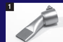
Wide slot nozzle 20 mm