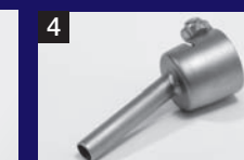
Tubular nozzle 5 mm