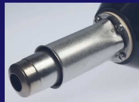
Heating tube protection for more security