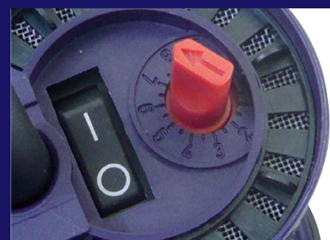
Free adjustable temperature