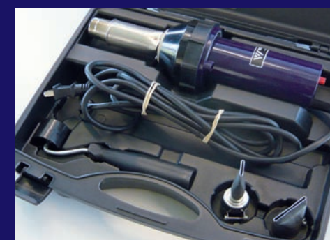
Sturdy case for easy storage (included with purchase)