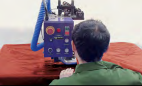
Perfect view on the welding process.