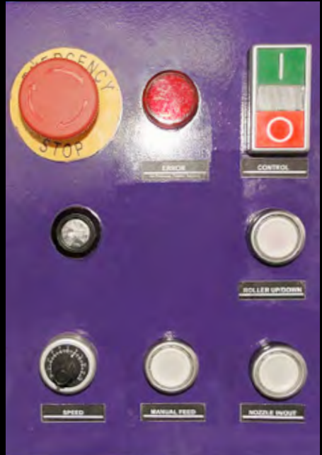
Clearly arranged operating elements.